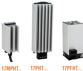
17MPHT... 17PHT... 17PFHT...